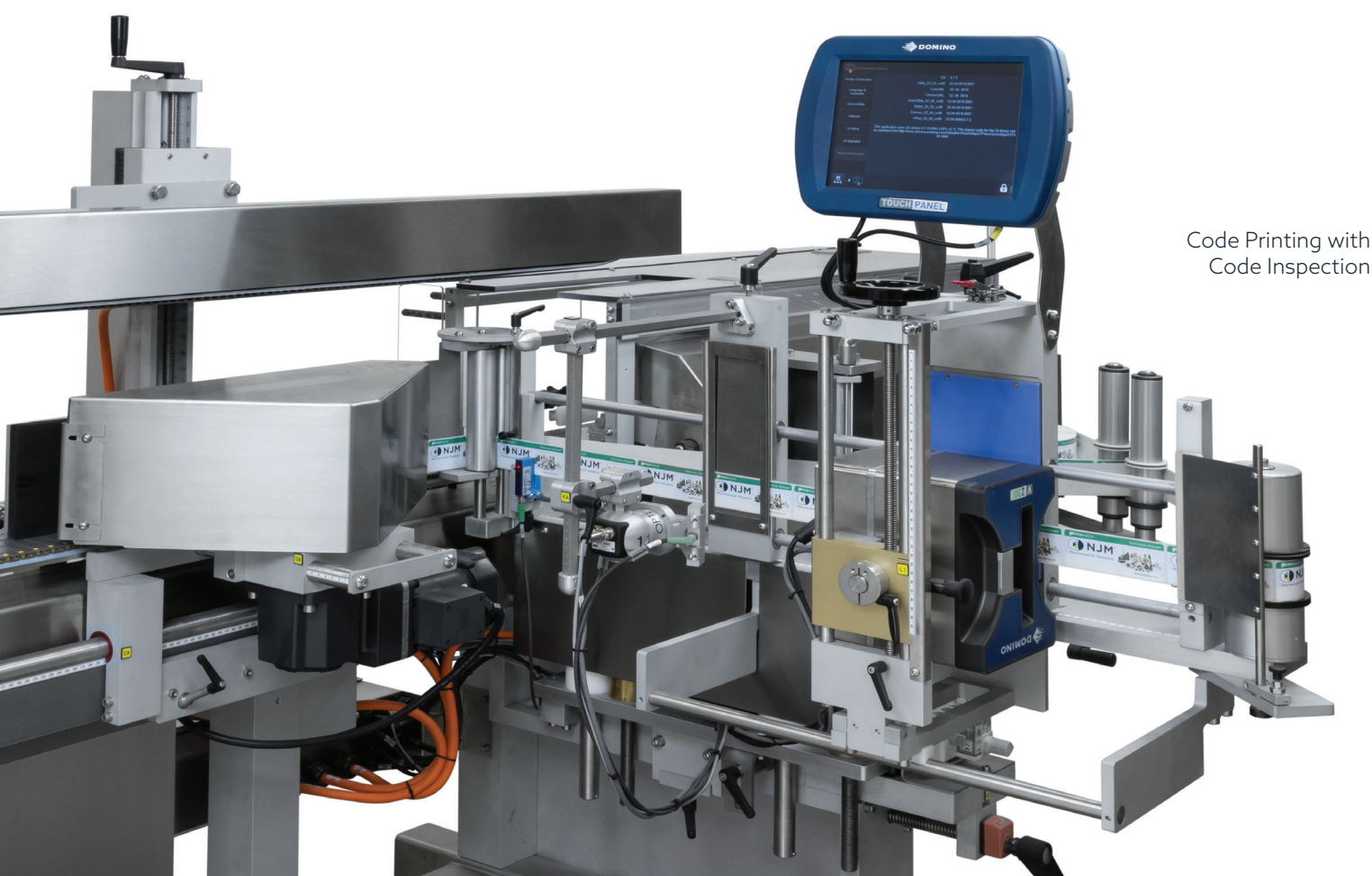
Code Printing with Code Inspection