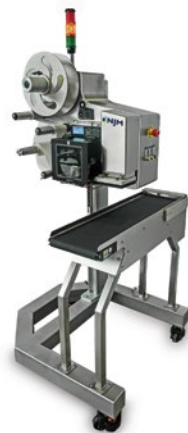
PRINT & APPLY LABELERS