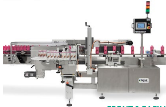
FRONT & BACK LABELERS