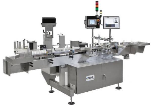
VIAL LABELERS & SERIALIZATION