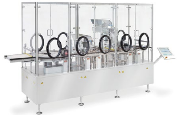
LIQUID FILLERS & CAPPERS