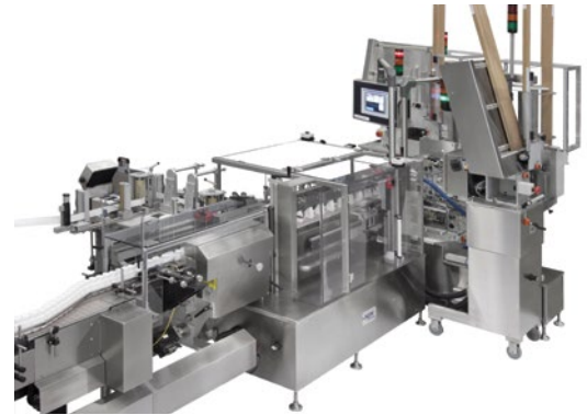
MULTI-PANEL LABELERS & OUTSERTERS