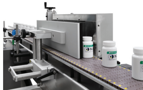
Wrap Belt and Conveyor Outfeed