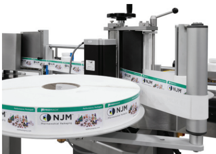
Label Dispenser Unwind