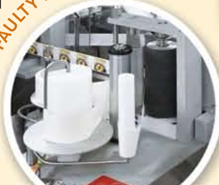
FAULTY LABEL REMOVAL