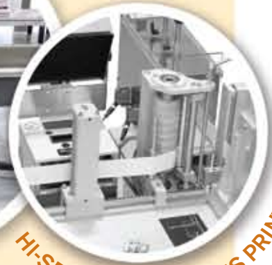
HI-SPEED CONTINUOUS PRINTING