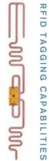
RFID TAGGING CAPABILITIES