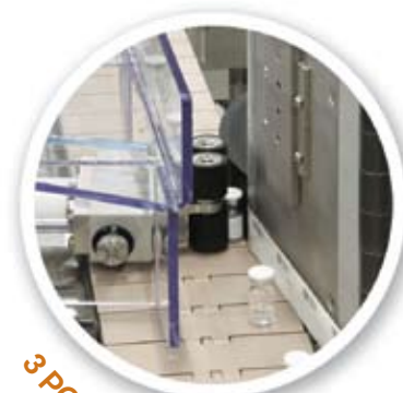
3 POINT APPLICATOR