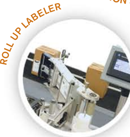
ROLL UP LABELER