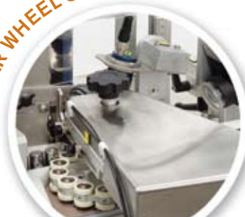
STAR WHEEL SYSTEM

Available options for the Model 130 BRONCO