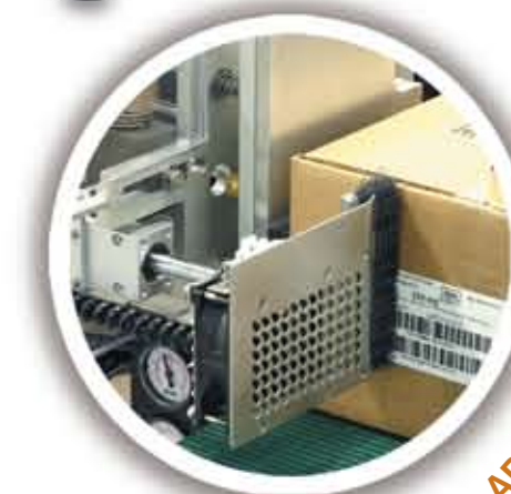
CORNER WRAP APPLICATOR