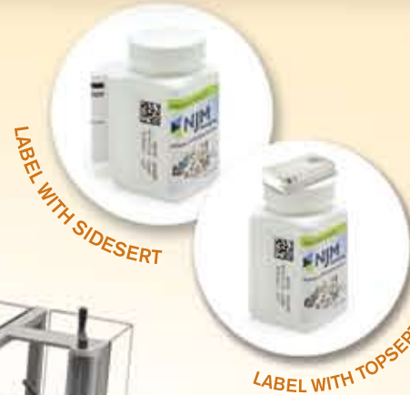
LABEL WITH SIDESERT