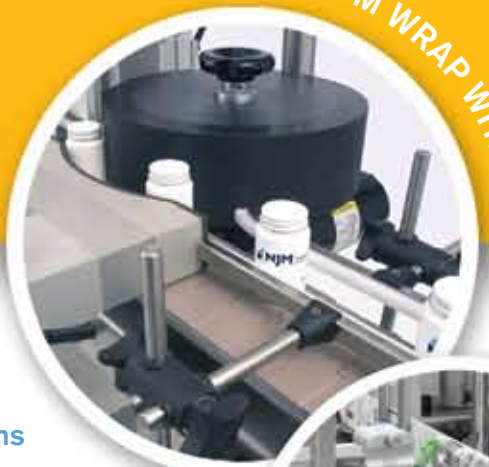
DRUM WRAP WHEEL